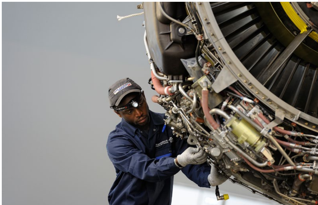
Trained engineers are dwindling while demand accelerates.

Lufthansa reached an agreement with the Italian Ministry of Economy and Finance to acquire a minority stake in the Italian national carrier ITA Airways. Lufthansa will obtain a 41 percent stake in ITA for EUR 325m through a capital increase. Upon closing of this transaction, ITA Airways and Lufthansa Group are expected to immediately start their cooperation at a commercial and operational level.