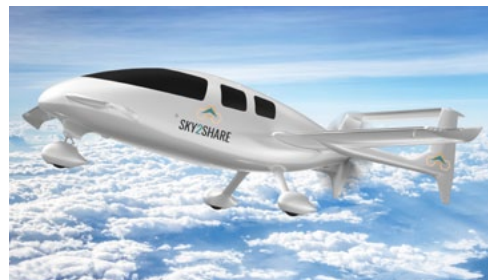
Rendering of VoltAero's Cassio 330 electric-hybrid aircraft for Switzerland's SKY2SHARE