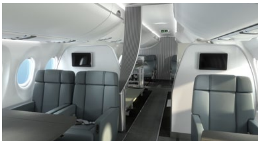
Image of ACJ TwoTwenty government cabin