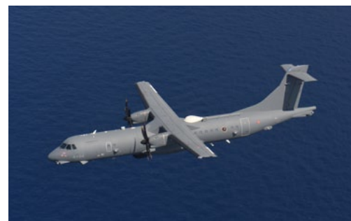
ATR 72MP in flight