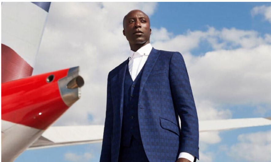
Fashion Designer Oswald Boateng has designed the new uniforms for British Airways