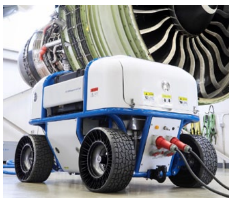
GE's 360 Foam Wash is an alternative to water wash for engine maintenance

SkyWest Airlines, a subsidiary of SkyWest, has been awarded a technical license from GE to use its 360 Foam Wash system on its CF34 aircraft engines, making SkyWest the first North American operator to license the patented engine cleaning system. Estimates are that 360 Foam Wash has the potential to help SkyWest Airlines avoid up to 13,900 metric tonnes of CO 2 emissions a year by replacing some water washes with foam wash for CF34 engine cleaning. GE's 360 Foam Wash is an alternative to water wash for engine maintenance. It can help restore engine performance, leading to reduced fuel consumption and improved time on wing. The process involves injecting a specially formulated, proprietary solution that reduces build-up of deposits in the engine, which can lower engine exhaust temperatures and improve engine compressor efficiency. The license was awarded following technology testing and equipment training. SkyWest Airlines aircraft technicians can now perform this new cleaning technique on their own to maintain the airline's fleet of CF34 engines powering its Embraer 175 and MHI CRJ700 and CRJ900 aircraft. The foam wash system is self-contained, allowing it to be used inside maintenance hangars and outdoors. Foam Wash is approved for use on multiple GE engine programmes, including models of the GE90, GENx, and CF34 engine.