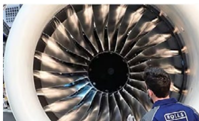
The Pearl 10X engine will power Dassault's flagship, the Falcon 10X jet