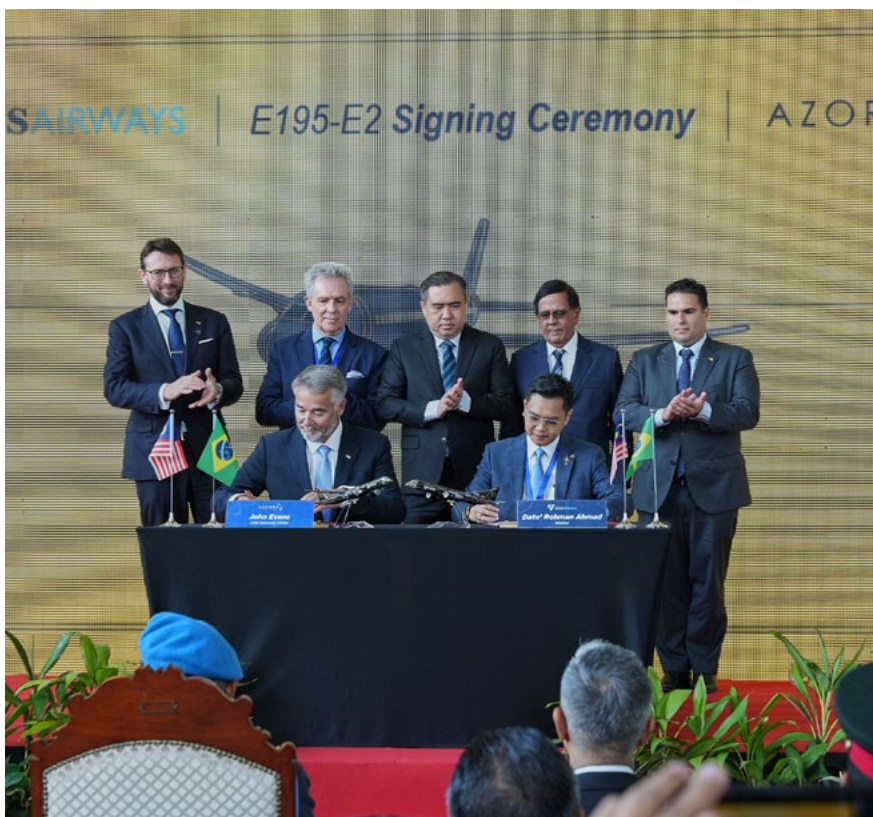
Signing of the service agreement between Embraer and SKS Airways