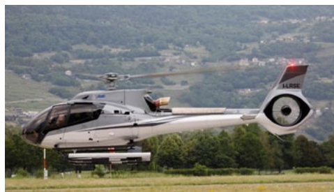
ACH130 of Air Corporate