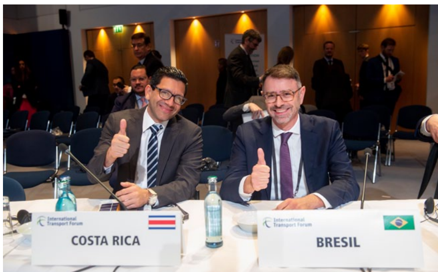
Brazil and Costa Rica have joined the International Transport Forum