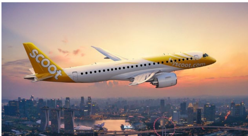
Scoot has chosen Embraer E190-E2 jets to unlock growth in the region