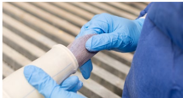
Jet Aviation started first use of bio-based resin in VVIP completion projects

Jet Aviation, an offshoot of General Dynamics, has announced that its Basel, Switzerland facility is to start using bio-based resin for composite parts in its VVIP cabin interiors. The company currently has two completion projects it is working on, and these parts will be integrated into them both. The resin is produced from up to 25% plant origin biological