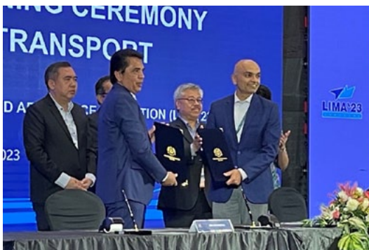
Signing ceremony of the MRO services agreement between MAB Engineering and Spirit AeroSystems

Spirit AeroSystems has finalised a partnership agreement with MAB Engineering Services (MAB Engineering) to provide MRO services for nacelle and flight control surfaces to Malaysia Airlines and other operators at Kuala Lumpur International Airport, Sepang, Malaysia. The agreement finalises a Memorandum of Understanding the companies have announced during the 2022 MRO Asia-Pacific in Singapore. MAB Engineering is a wholly owned entity of the Malaysia Aviation Group (MAG) and