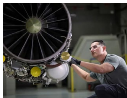
GE Aerospace has opened its newest Beavercreek, Dayton-area manufacturing site