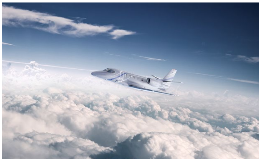
The Cessna Citation Ascend