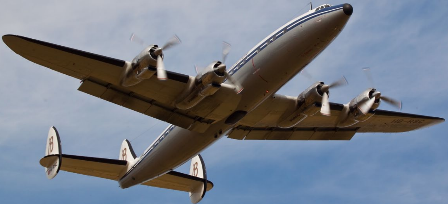
Lockheed Super Constellation