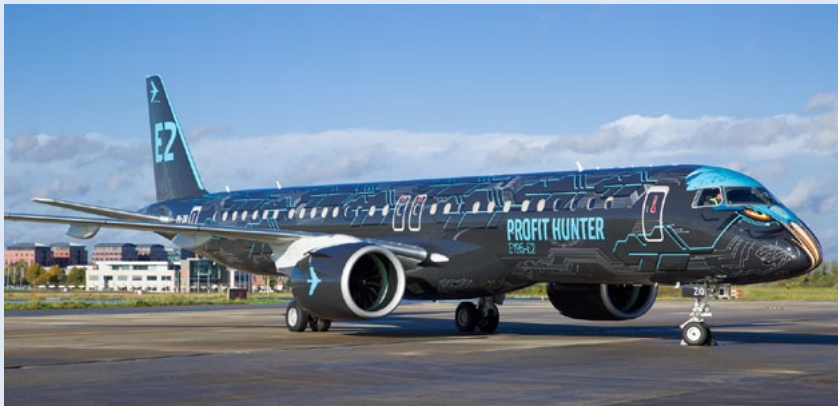
E195-E2 'Tech Eagle'