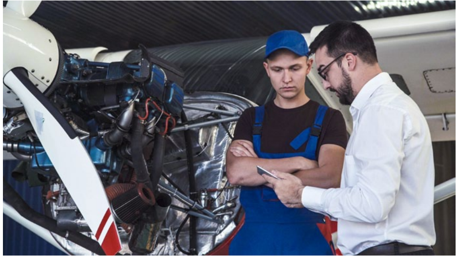
Today technology is key in aircraft maintenance

As we look to the future, aircraft maintenance will continue to evolve in response to emerging technologies and changing industry needs. Innovations such as 3D printing hold the potential to revolutionize the way spare parts are manufactured and replaced, reducing downtime and costs. Drone-based inspections are becoming more