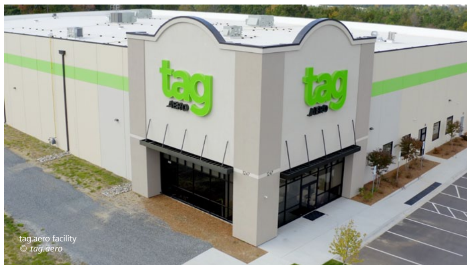
tag.aero facility

To learn more about tag.aero, go to www.tag.aero