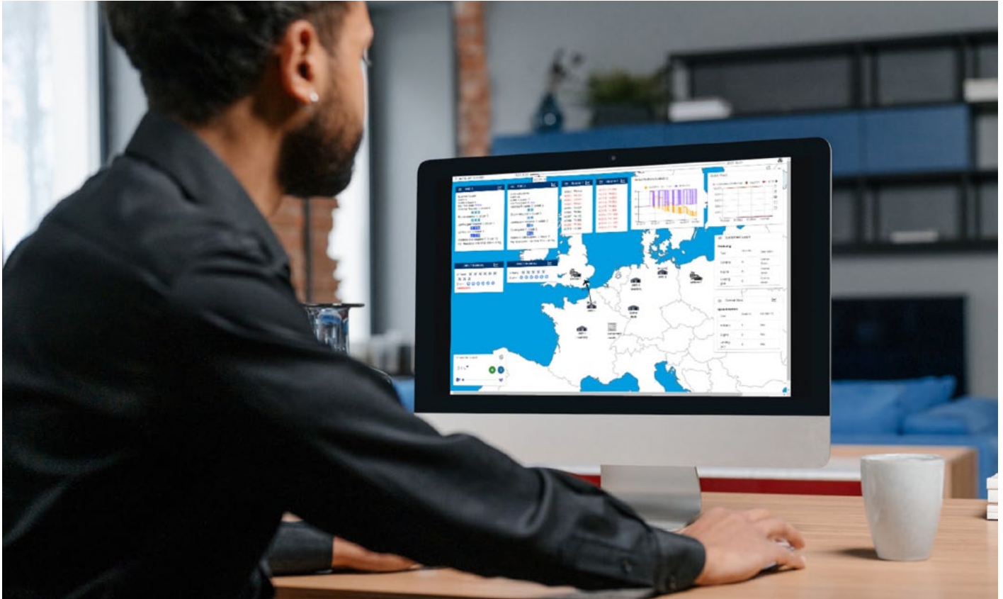
AI helps scheduling MRO activities