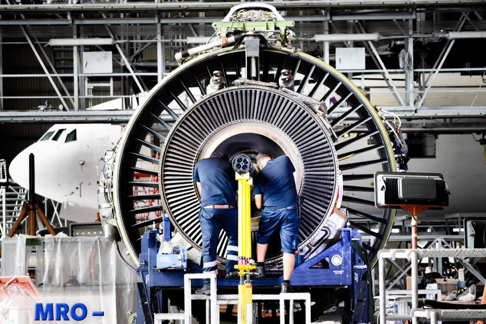
Engine removed from aircraft