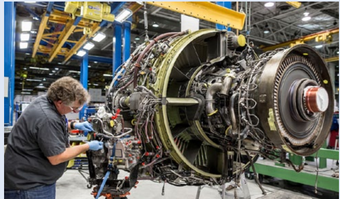
© Engine mechanic at Tech Ops -Tulsa © American Airlines

American Airlines (American) has been awarded US$22 million from the State of Oklahoma’s Business Expansion Incentive Programme. The funds, to be received over the course of three years, will be used to further grow and improve the airline’s maintenance base and engine repair and overhaul facility in Tulsa, Oklahoma (Tech Ops – Tulsa). With this investment, the airline has announced more than US$400 million in enhancements at the maintenance base over the last three years. The funds are in addition to American’s recent US$31.6 million capital investment in the engine shop to modernise machinery and an ongoing multi-million-dollar improvement project at Tech Ops – Tulsa. Tech Ops – Tulsa has served as the principal location for airframe and engine maintenance and overhauls for American’s aircraft since 1946 and is one of the largest commercial aviation maintenance bases in the world. Located on 246 acres of land at the Tulsa International Airport, Tech Ops – Tulsa includes approximately 3.3 million ft 2 of building space, six hangars with 24 aircraft bays, and 22 support facility buildings. Nearly 5,000 team members are currently employed at the base and more than 800 of the