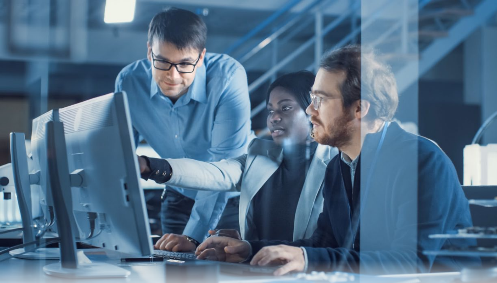
Engineers studying performance data