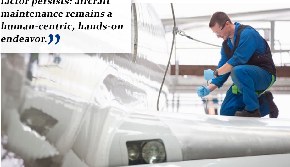
Despite technology - no aircraft maintenance without mechanics

“However, one constant factor persists: aircraft maintenance remains a human-centric, hands-on endeavor.”