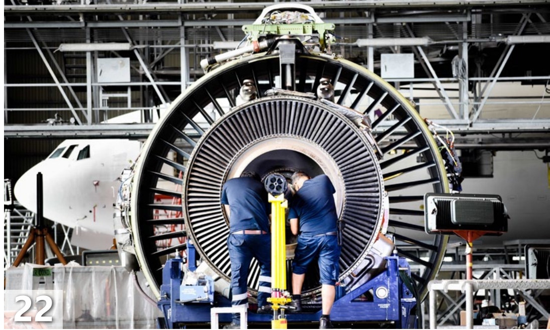
MRO – the challenging outlook for 2024