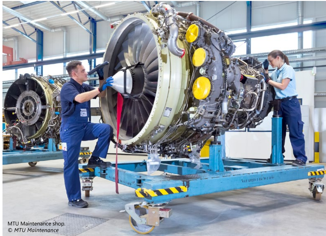
MTU Maintenance shop.

tasks and intervals defined on failure effect mods and in-service experiences: being preventive maintenance,” Marty adds.