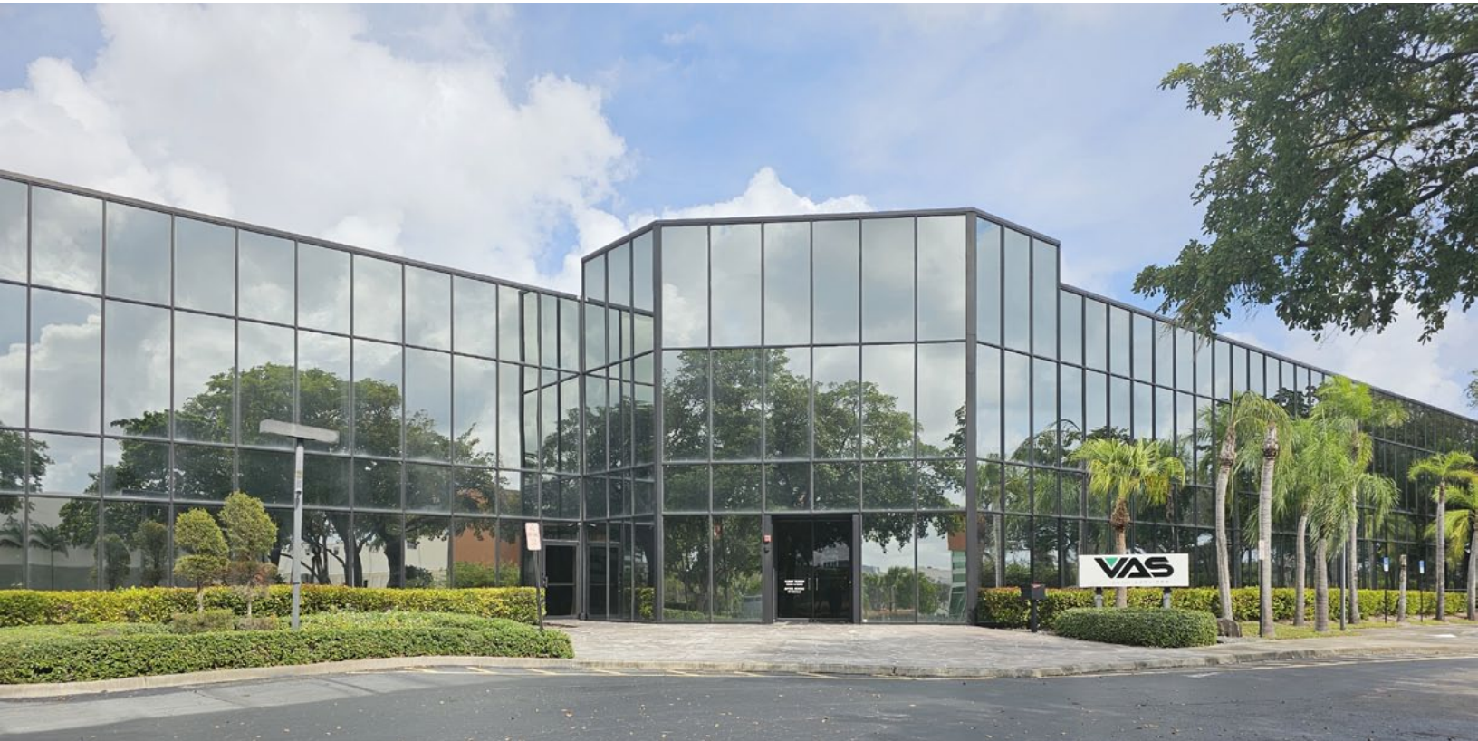
VAS Headquarters, Boca Raton, Florida

specifically for aftermarket trading, re-distribution of assets, and program management reporting.