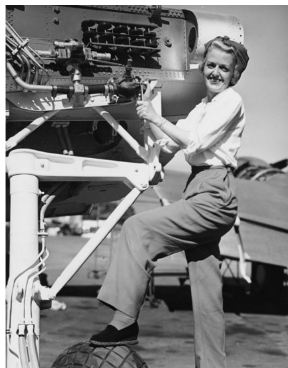
Female mechanic in the early days of aviation

The outbreak of World War I in 1914 heralded a turning point for aviation and aircraft maintenance. The demands of the war effort led to rapid advancements in aircraft technology. Aircraft became more complex, and their engines more reliable. Consequently, maintenance procedures