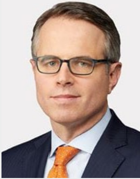
Christopher T. Calio

In a planned leadership transition, RTX has announced that President and Chief Operating Officer Christopher T. Calio will succeed Gregory J. Hayes as Chief Executive Officer (CEO) at the 2024 RTX annual shareowners meeting scheduled for May 2, 2024. Hayes will continue to serve as Executive Chairman of RTX. Calio has also been appointed to the company's Board of Directors effective December 14, 2023. As