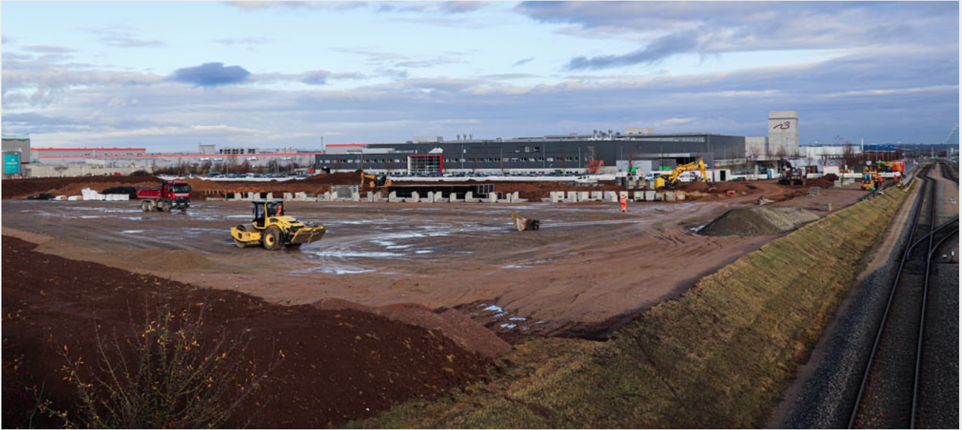
N3 expansion in Germany