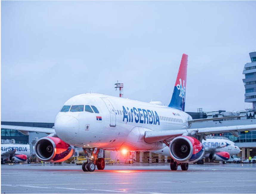
Air Serbia Airbus A320neo