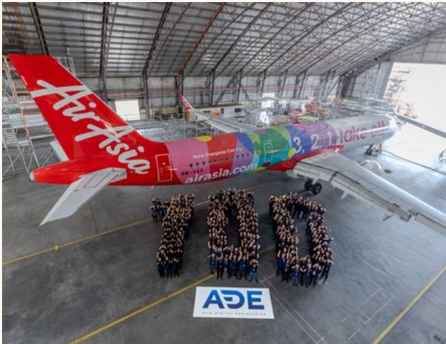
Asia Digital Engineering staff members with the 100th C-check aircraft

Asia Digital Engineering (ADE), a wholly-owned subsidiary of Capital A Berhad specialising in aircraft maintenance, repair, and overhaul (MRO), has marked a significant accomplishment by successfully completing its 100th C-check within a timeframe of