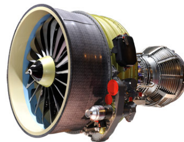
The LEAP-1A engine chosen by Pegasus Safran

Pegasus Airlines selected CFM International's advanced LEAP-1A engine to power its new fleet of 75 firm, 25 option A320neo/A321neo aircraft. The airplane order was announced in December 2012 and the airline is scheduled to begin taking delivery of the aircraft in 2016. Total LEAP orders now stand at more than 5,300 engines. The Istanbul-based low cost airline has been a CFM customer since it began operations in 1990. Today, the airline operates a fleet of 43 CFM-powered Boeing 737 aircraft on scheduled routes to 72 domestic and international destinations throughout Europe, Russia, Central Asia, Middle East and Africa.