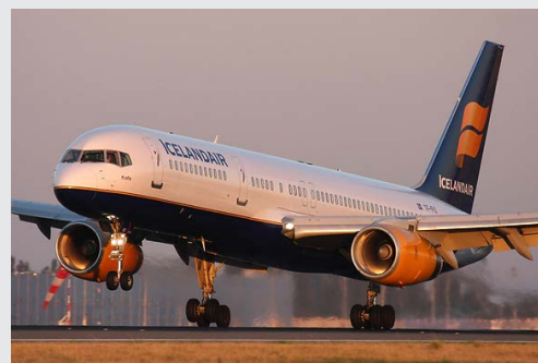
Icelandair expands its services to Canada