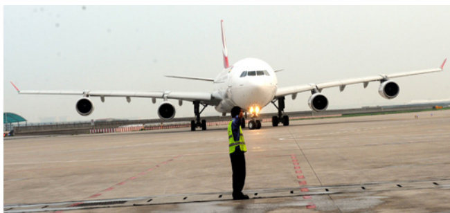
Ameco kitted out Air China's fleet with a new Wi-Fi system

Air China has its Airbus fleet fitted with in-flight Wi-Fi system by Ameco Beijing. The company has recently returned its second modified aircraft to the customer on schedule. Being authorized by CAAC and EASA, Ameco now is capable of in-flight Wi-Fi installation on Air China fleet with the key technique in Electromagnetic Interference/ Electromagnetic Compatibility (EMI/EMC) test. With the in-flight Wi-Fi system, passengers can use their own portable electronic devices, such as laptop computers and personal digital assistants, during flight. It enables internet access, mail, Wi-Fi chat as well as the cabin-wide HD video streaming in wide-body aircraft for more than 300 passengers. Ameco has started to provide the in-flight Wi-Fi installation on Air China's A330-200 wide-body fleet as a complete upgrade of the current system. Besides, modification on Air China's Boeing 777 fleet will start soon in early 2014.