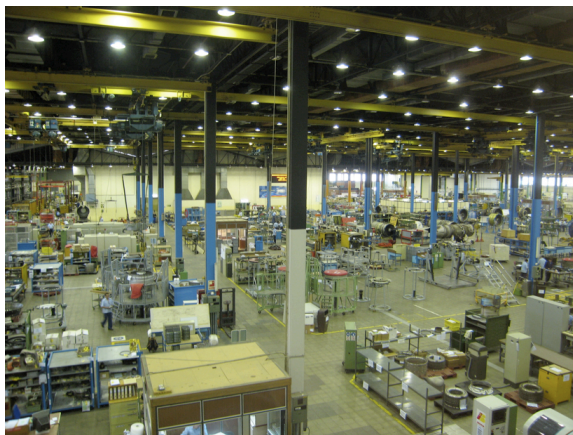
The Iberia Engine Shop in Madrid (above)

The Iberia Engine Shop is currently certified to repair CFM, RB211, Pegasus, JT8 and CF34 engines, repairing more than 200 engines per year. By November next year, Iberia will have the capability to totally dismantle, overhaul and test V2500 engines.